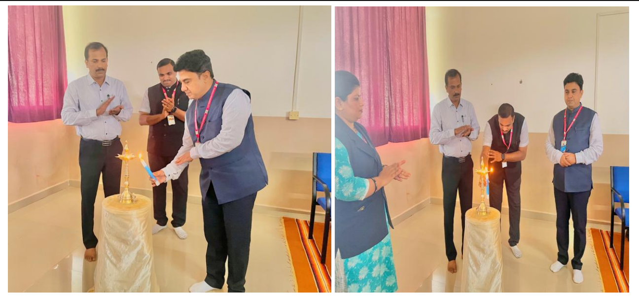
Lamp lighting ceremony by the auspicious hands of dignitaries