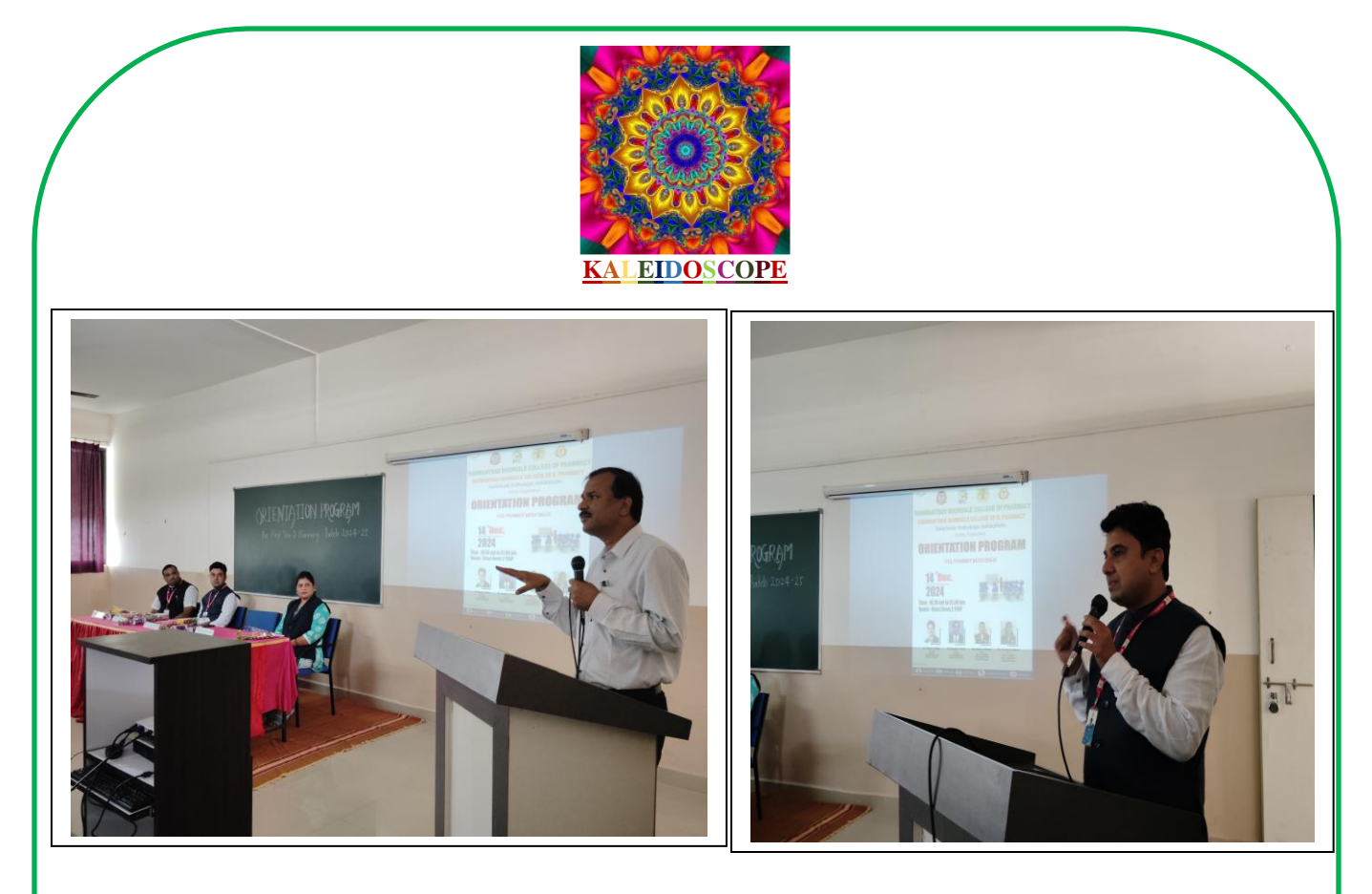
Executive chairman of BKC and Principal of YBCP delivering address note to students