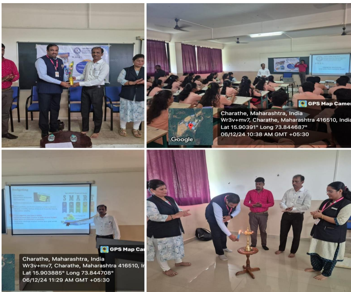
Lamp Lightening & Floral welcome of guest