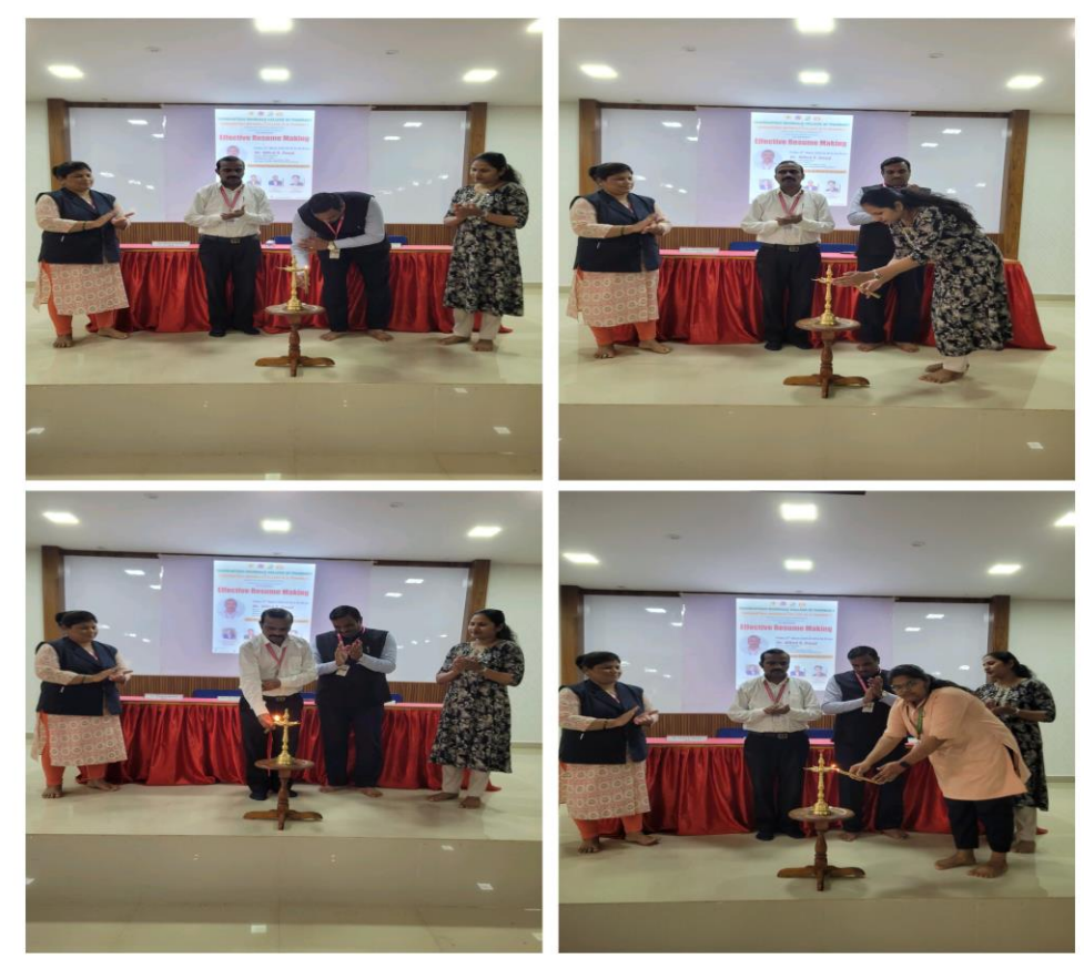
Snaps of Lamp Lightening Ceremony