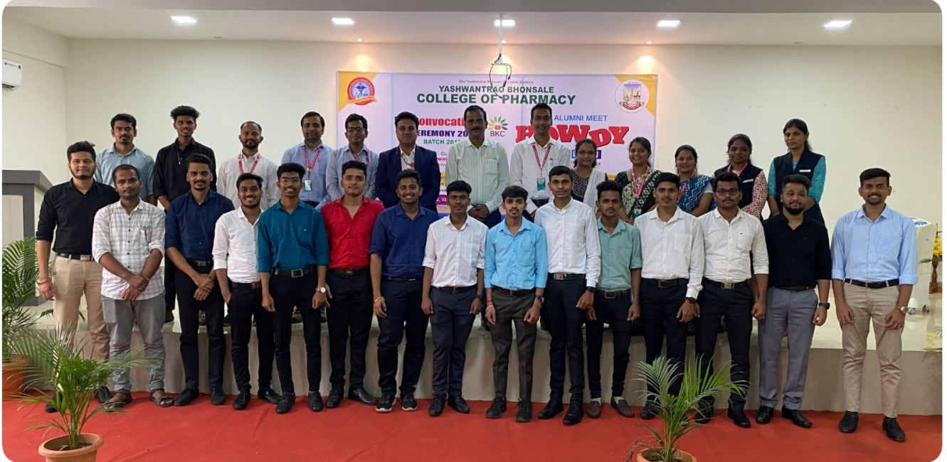
Glimpse of HOWDY ALUMNI MEET-V