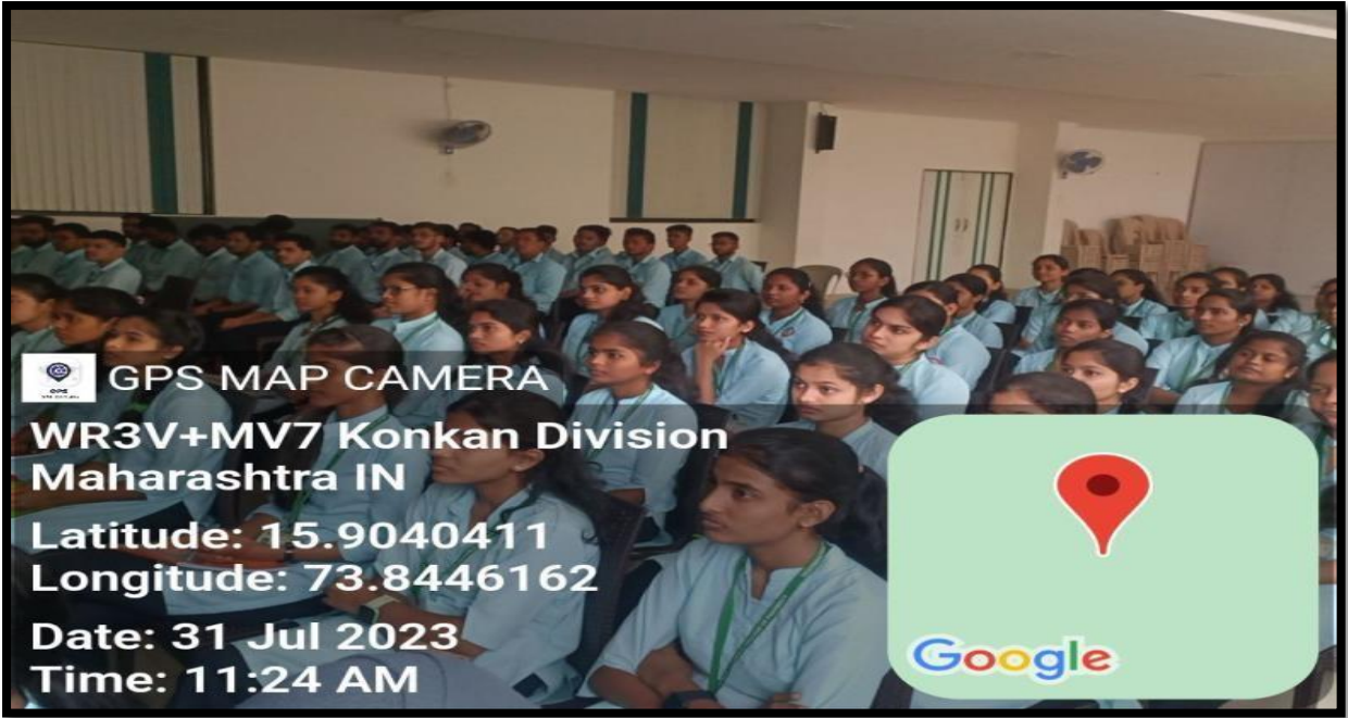
Student's participation in the event