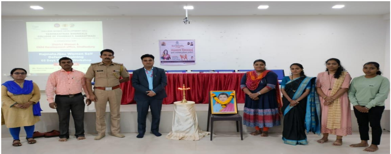
Lamp lightening and garlanding to Legendary Late Savitribai Phule photo of dignitaries