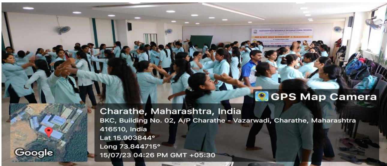
Day 3:Practice session of self defense