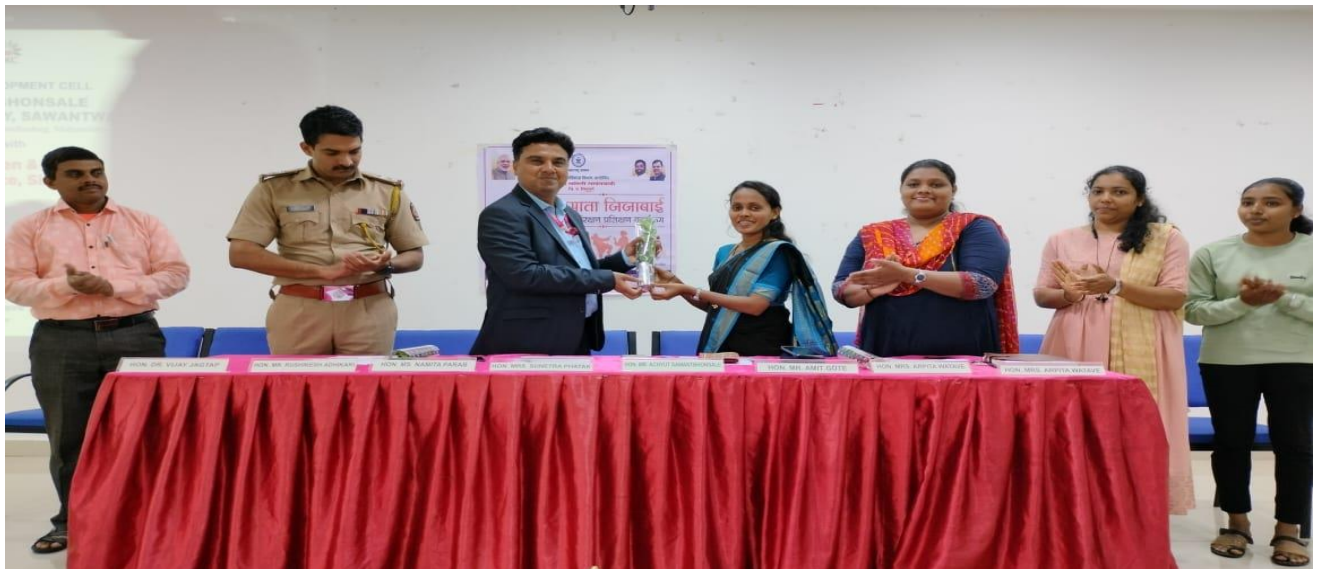
Felicitation of guest