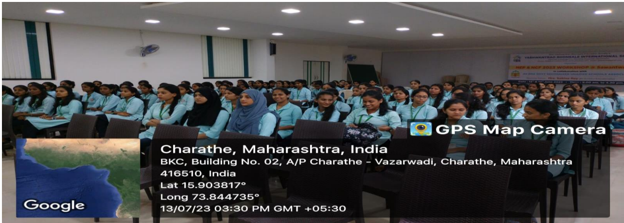
Girl students of B.Pharmacy present for the session