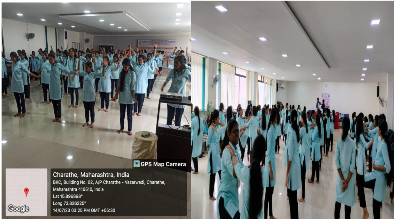
Day 2 :Basic warm up and self defense techniques