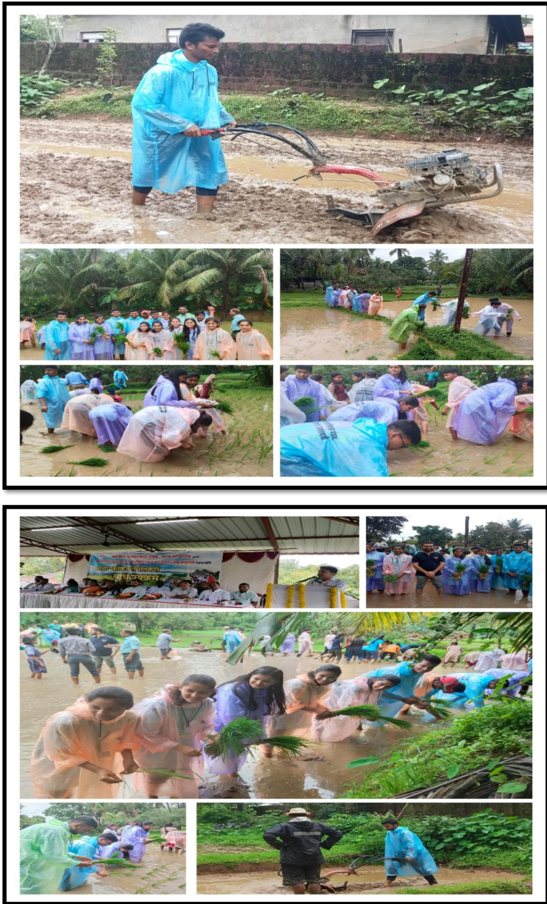
Students participation in the program