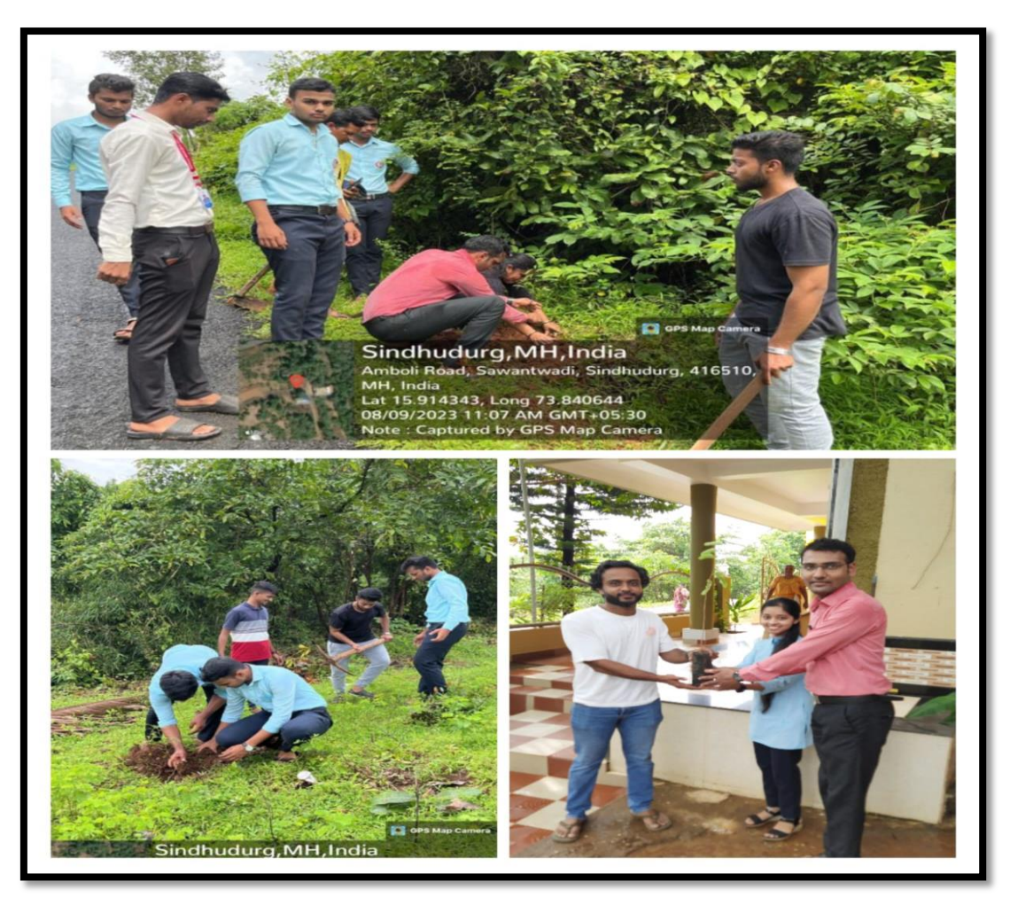
Students participated in tree plantation at Charathe (University Adopted Village)