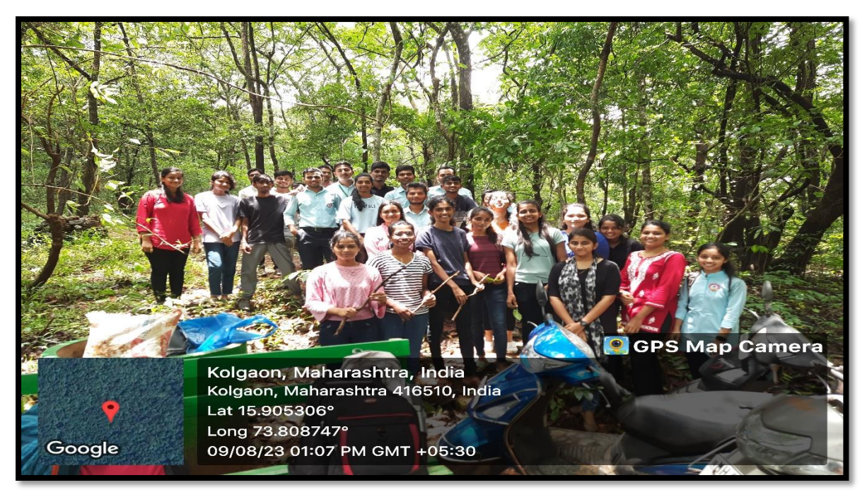
Participated students in tree plantation drive