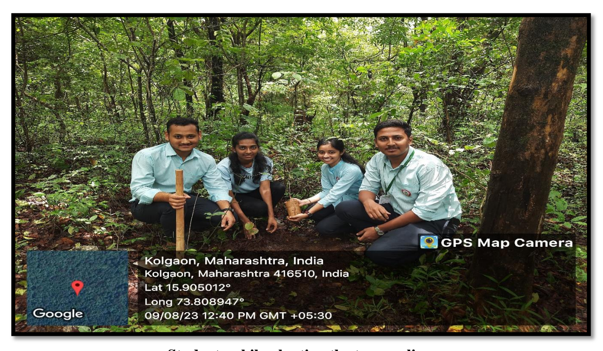
Students while planting the tree saplings