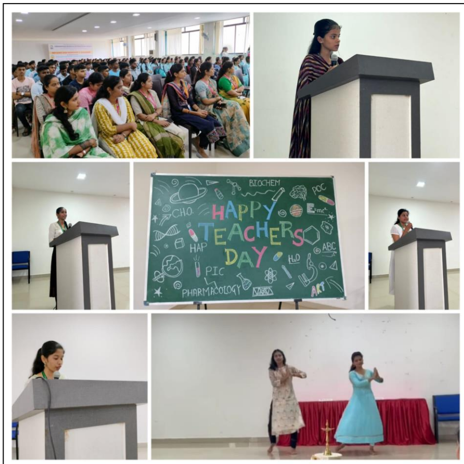
“Students performed various activities like dance, speeches etc.”