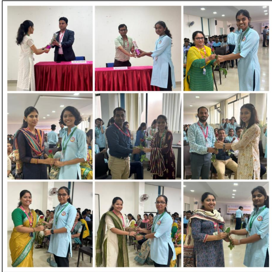
“Students expressed their gratitude towards all teachers by felicitating with flower”