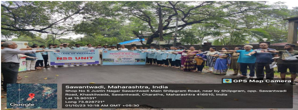
All the participants in Cleanliness Drive taking oath.