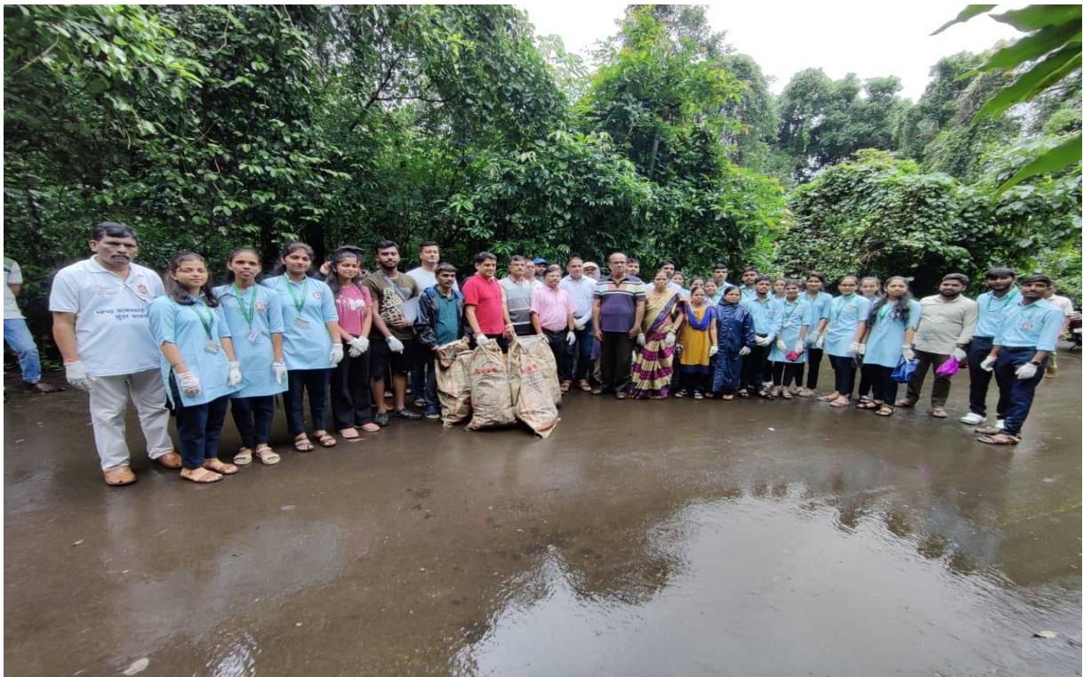
Our NSS volunteer's with Rotary Members and other Organizations