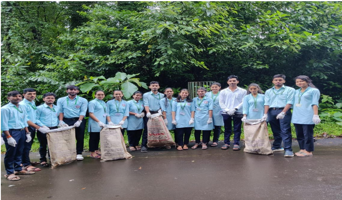
Volunteers picking garbage, wearing gloves and dumping in the bags