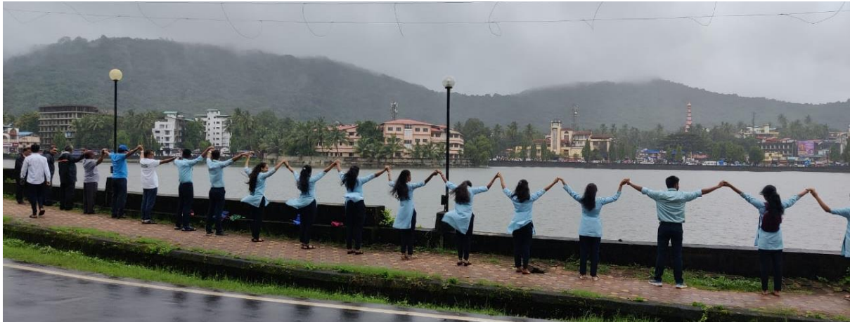
Formation of HUMAN CHAIN around Moti Talav, Sawantwadi