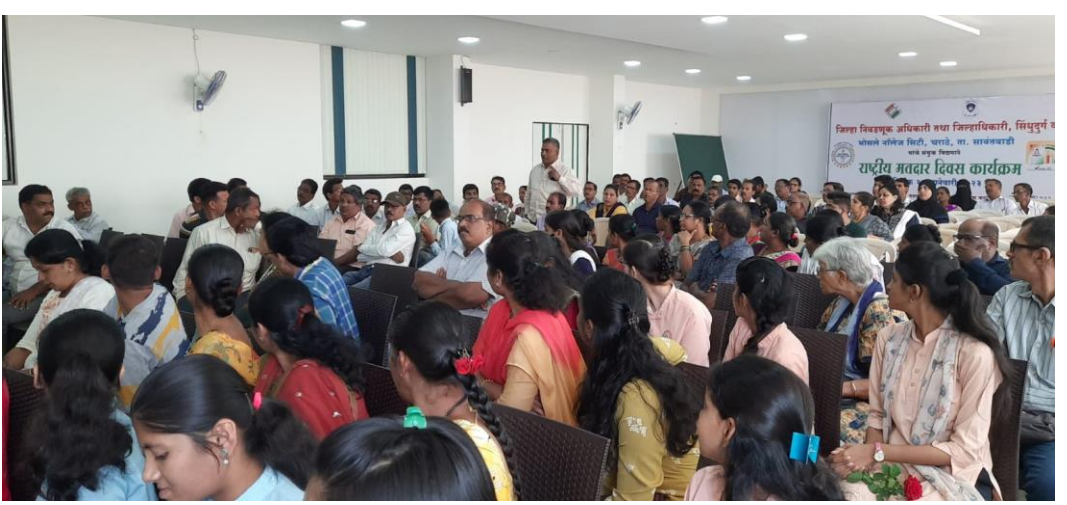
Students' & Parents' Participation