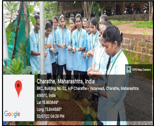
Seed Ball Activity