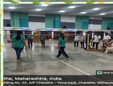
Charate, Maharashtra, India Building No. 02, A/P Charathe - Vazarwadi, Charathe, Maharashtra India