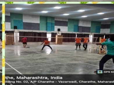
Charate, Maharashtra, India Building No. 02, A/P Charathe - Vazarwadi, Charathe, Maharashtra India