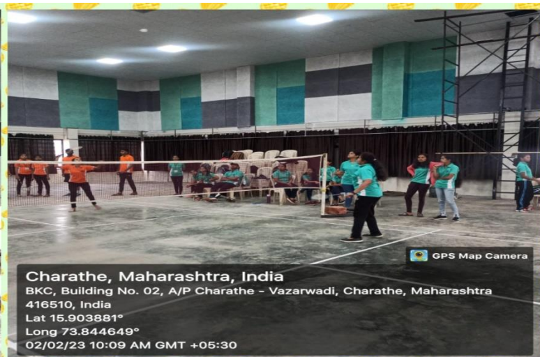
Charate, Maharashtra, India BKC, Building No. 02, A/P Charathe - Vazarwadi, Charathe, Maharashtra 416510, India Lat 15.903881° Long 73.844649° 02/02/23 10:09 AM GMT +05:30