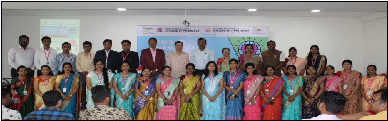
BKC Management and YBCP staff with Guest of Honor