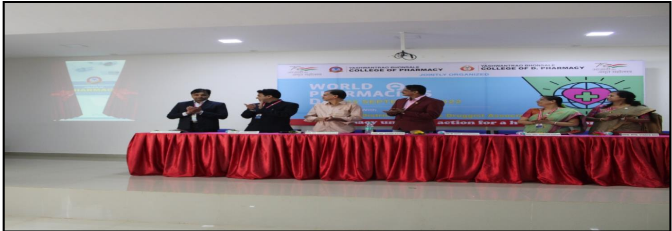
Inauguration of E-Magazine “PHARMANKUR”