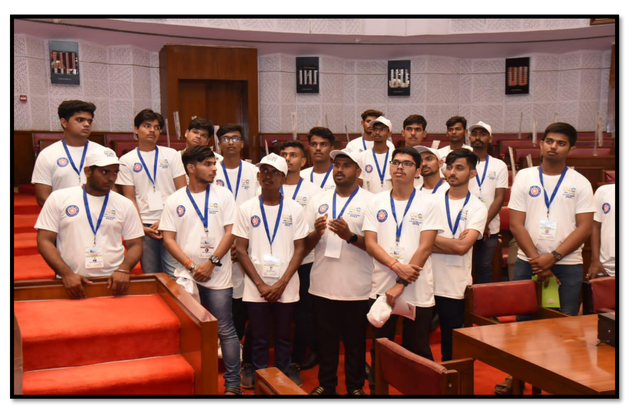
Student's interacting with the experts