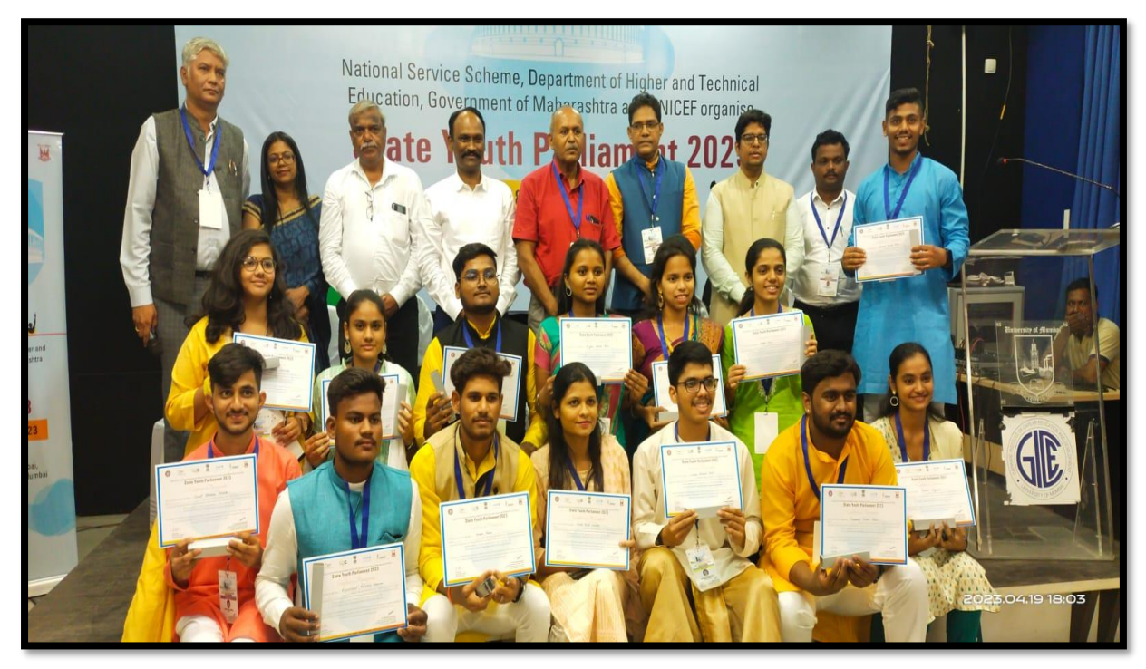
Glimpse of Valedictory Session and Certificate Distribution