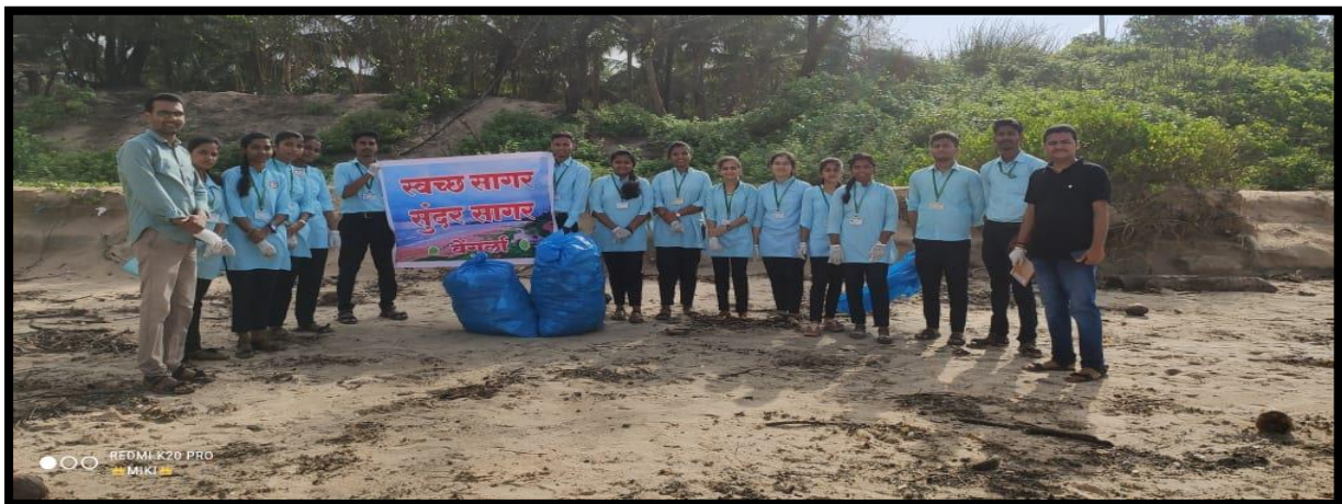
Participants at the site of cleanliness drive along with local authority.