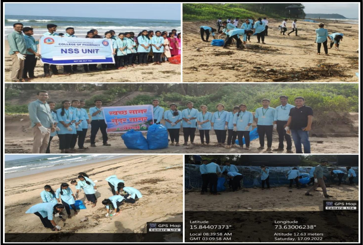
NSS volunteers collecting the waste at the site of cleanliness drive