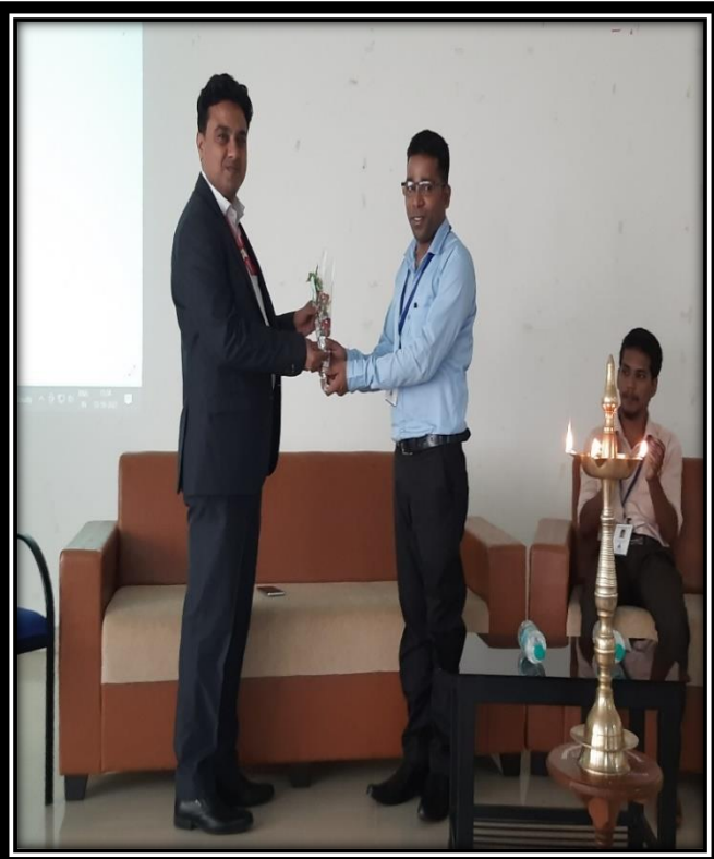
Felicitation of guest speaker by Hon. Principal of YBCP