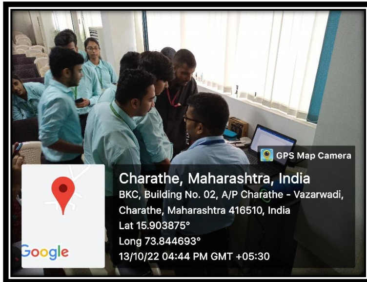
Demonstration of equipments