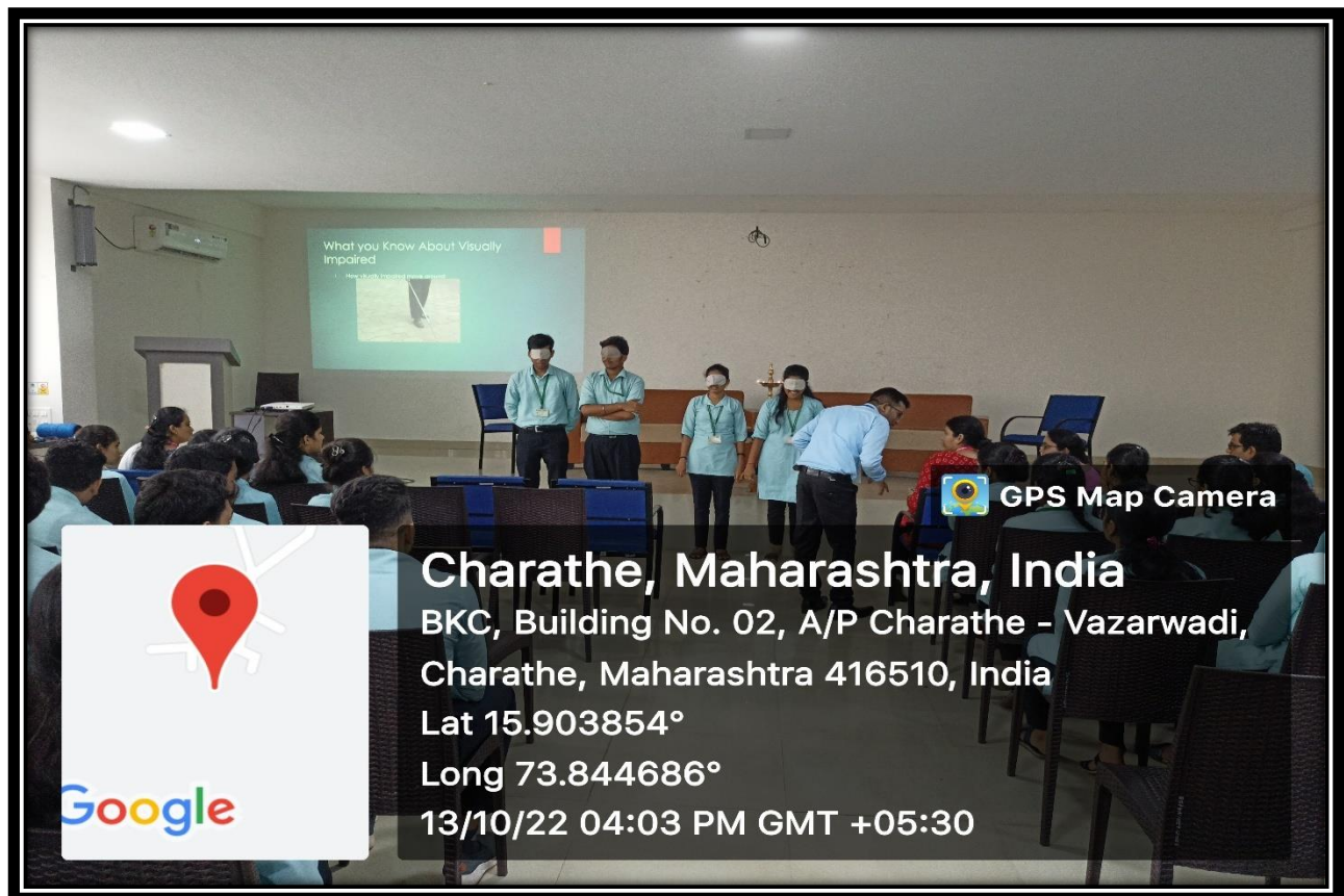
Activity carried out during the event