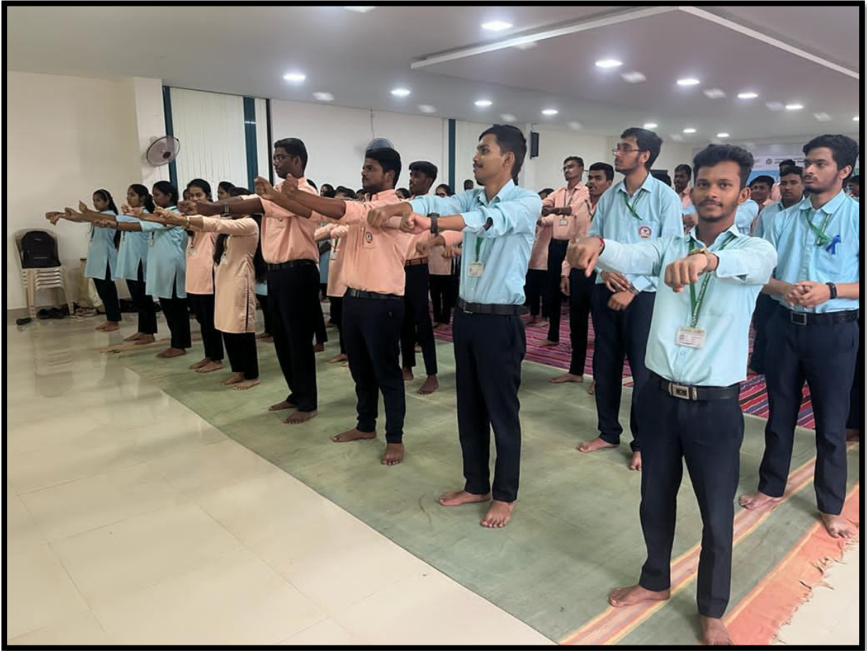
Students performing the exercise during the session