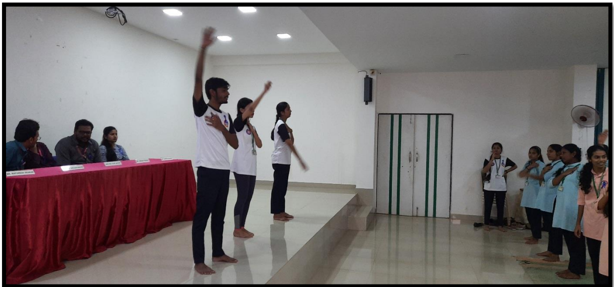
Demonstration by student volunteers of exercise