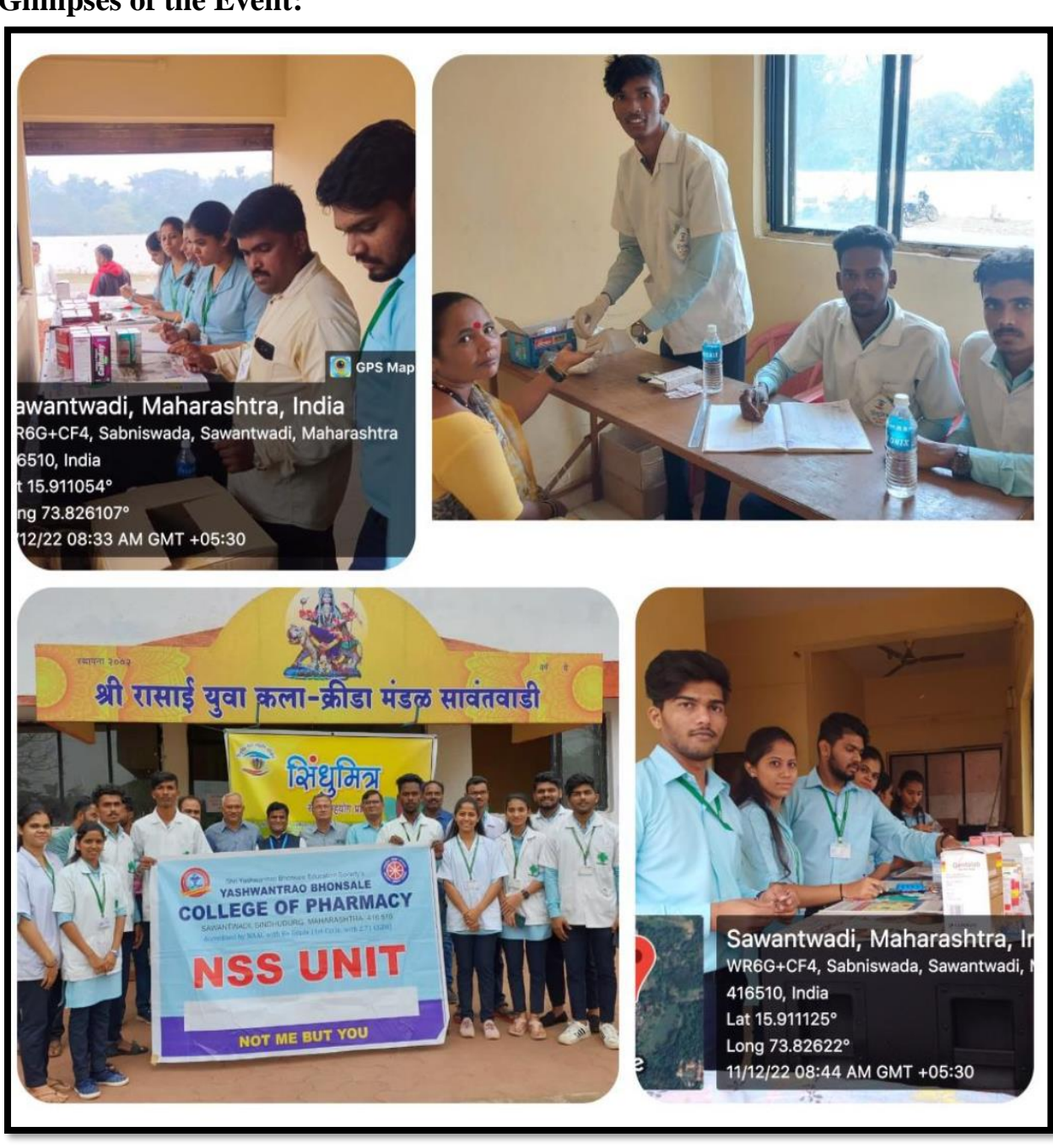
Students of YBCP worked as volunteers at Health Check Up camp