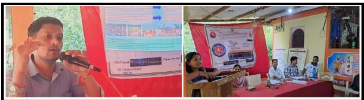
Lectures Delivered By Experts During The Session