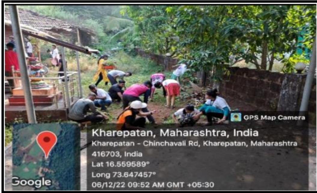
Cleanliness Drive at Camp