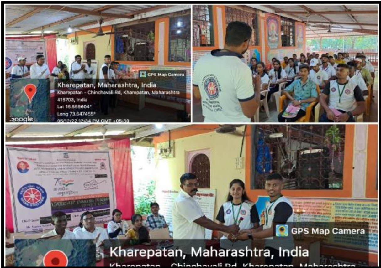
Students Felicitation at Camp