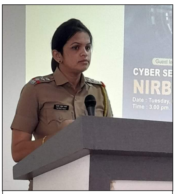
Speech Delivery by of Hon. Swati Yadav madam