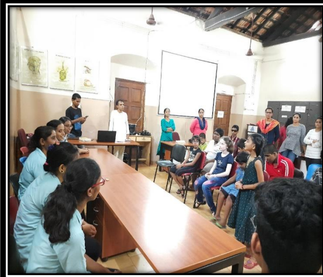
Interaction with the students