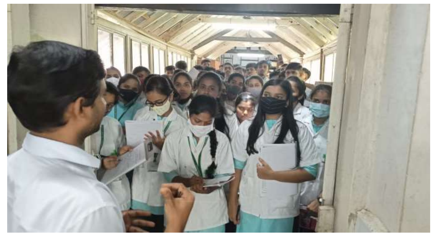
Hospital Pharmacy Section