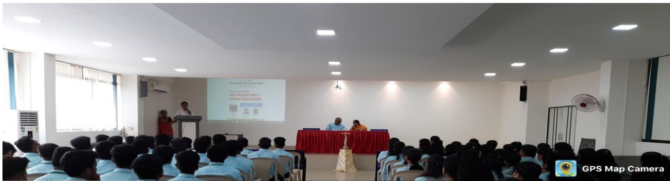
Participants for the session