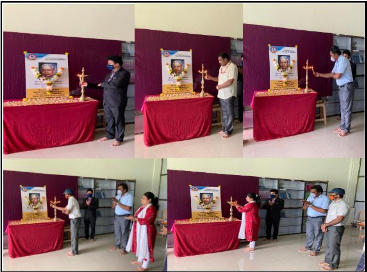
Lamp lightening by the honorable dignitaries and the members of LAC