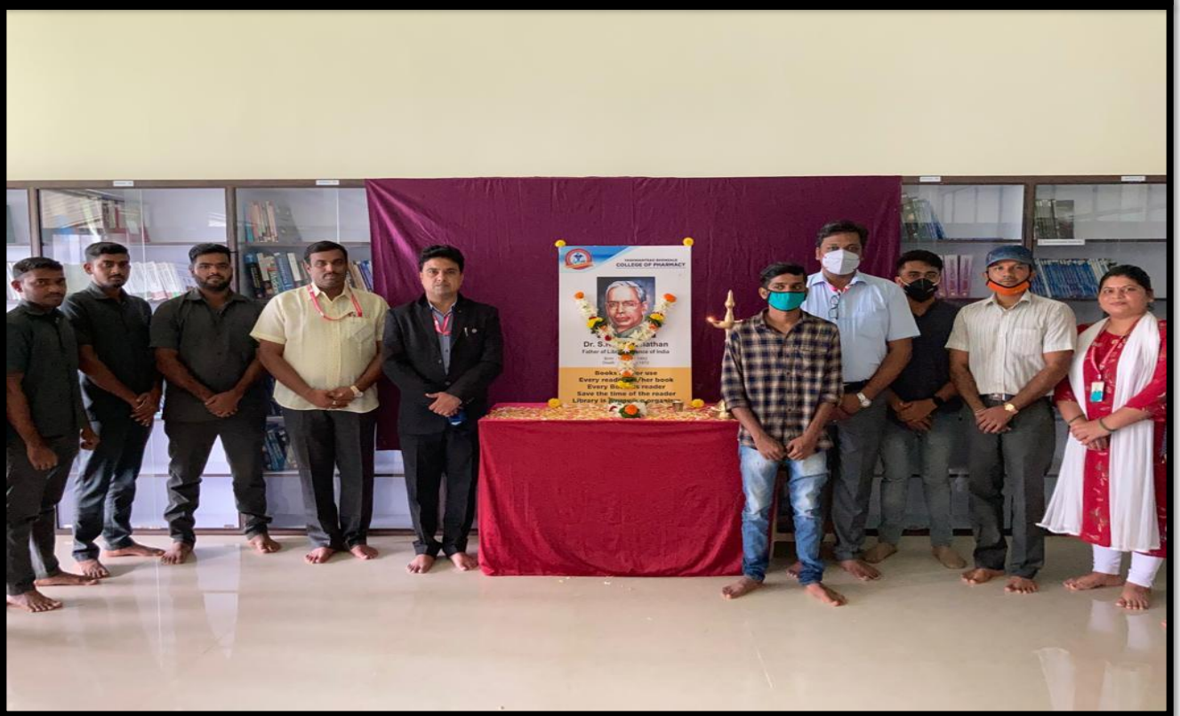
Group photo on the occasion of National Librarian's Day