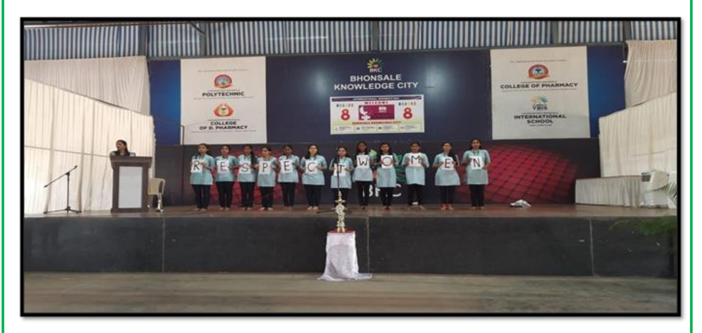
Act by YBCP students