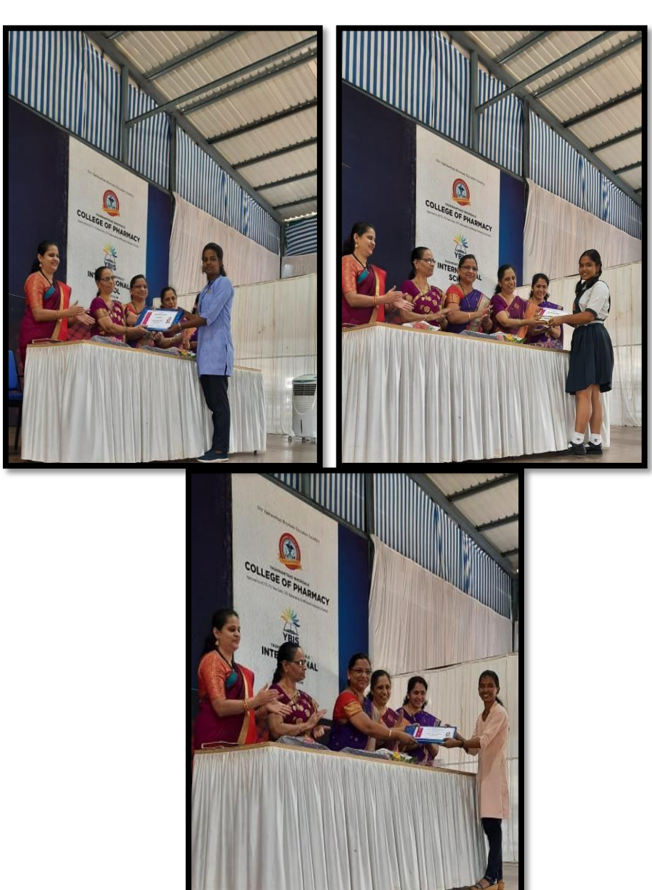
Appreciation of Winners by awarding Certificate