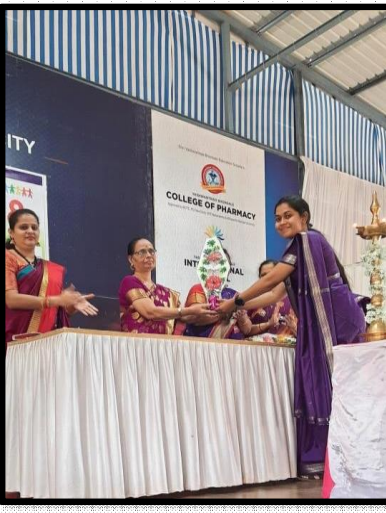
Address by Hon. Advt. Sou. Asmita Sawant Bhonsale Madam