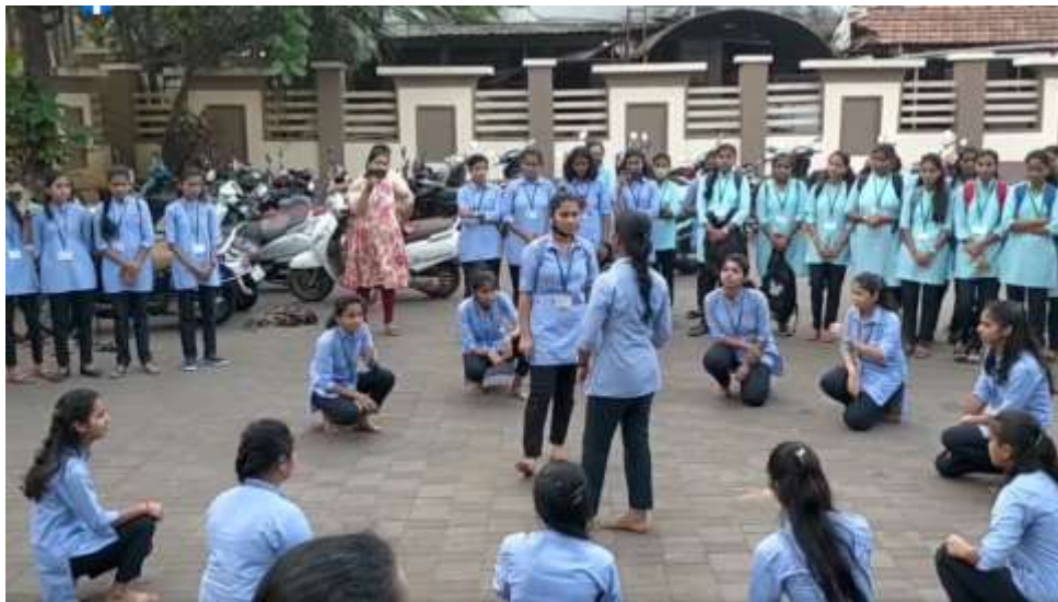
Streetplay on Gender Sensitization by YBCP students