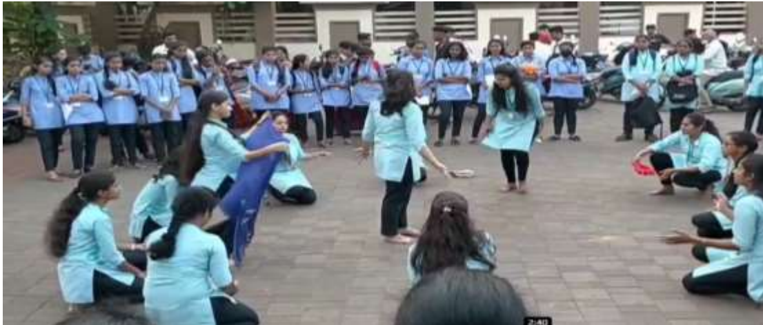
Streetplay on Gender Sensitization by YBCP students