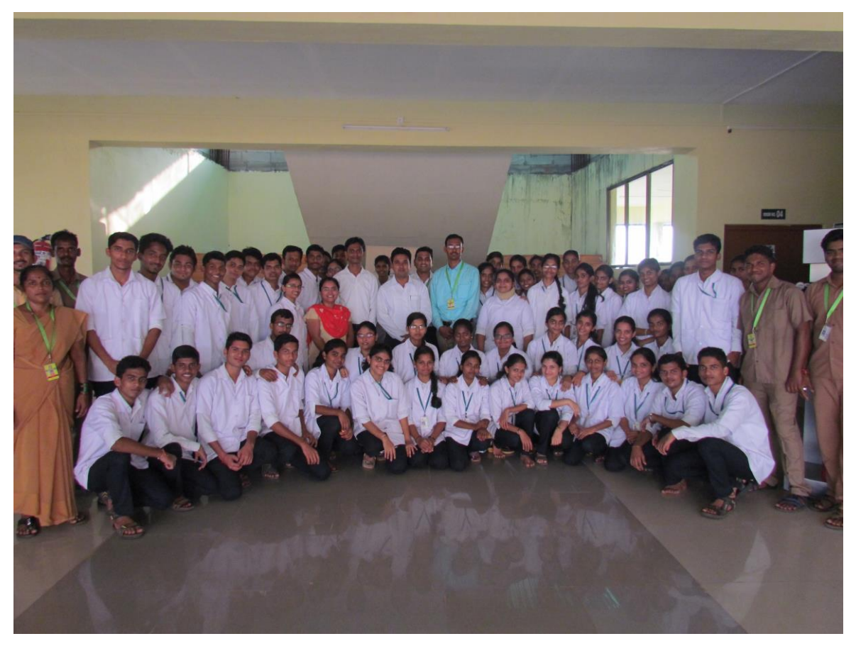
All pharmacy students with teaching and non-teaching faculty