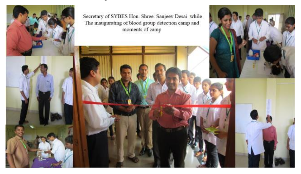
Yashwantrao Bhonsale College of Pharmacy, Sawantwadi – 416 510, Maharashtra State

In afternoon session celebration was extended by blood group detection camp. This camp was exclusively conducted for teaching and non-teaching faculties of Shree Yashwantrao Bhonsale Education Society. The inauguration was done by Secretary Hon. Shree. Sanjeev Desai. In blood group detection camp total 15 students were involved with total three group to determine blood group. Along with this also measured weight and height and accordingly calculated BMI. The especially designed cards given to visited staff members which contains all these parameters like name, age, weight, height, blood group and BMI. Total 65 teaching and non teaching staff members had taken the benefits from this camp.