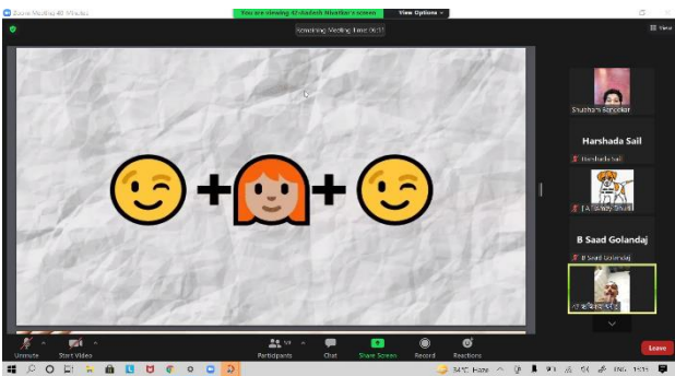
Fun activities arrange by F.Y. D.pharm