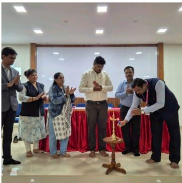
Welcoming of guest speakers